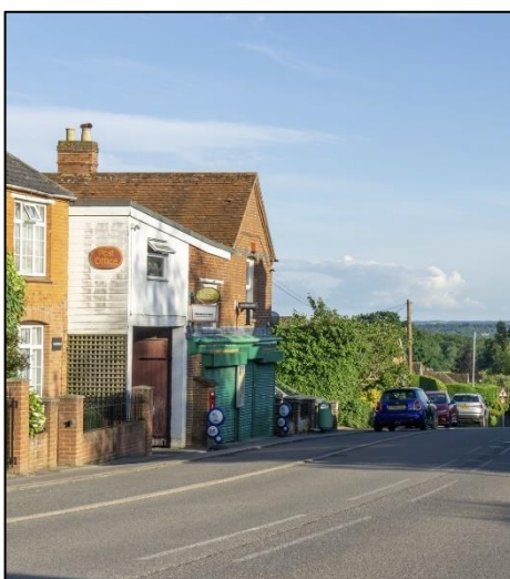
The village shop and post office

8.2. Table 8.1 shows the community facilities that have been identified as particularly important to the community and which should be safeguarded from loss. It also details improvements, where noted by the community, that would be supported by the policy. These are mapped on Figure 8.1.