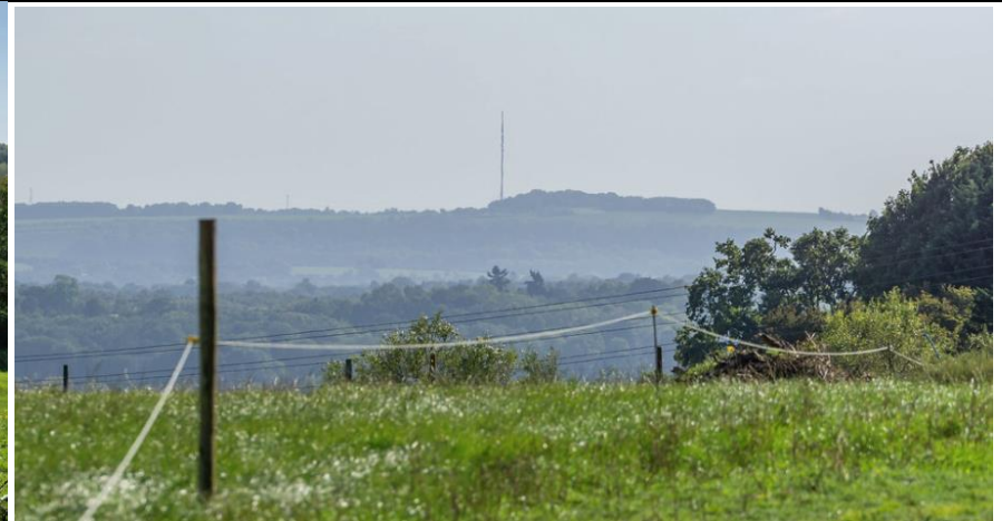
V9 From Footpath 15 looking east, towards Cold Ash Hill